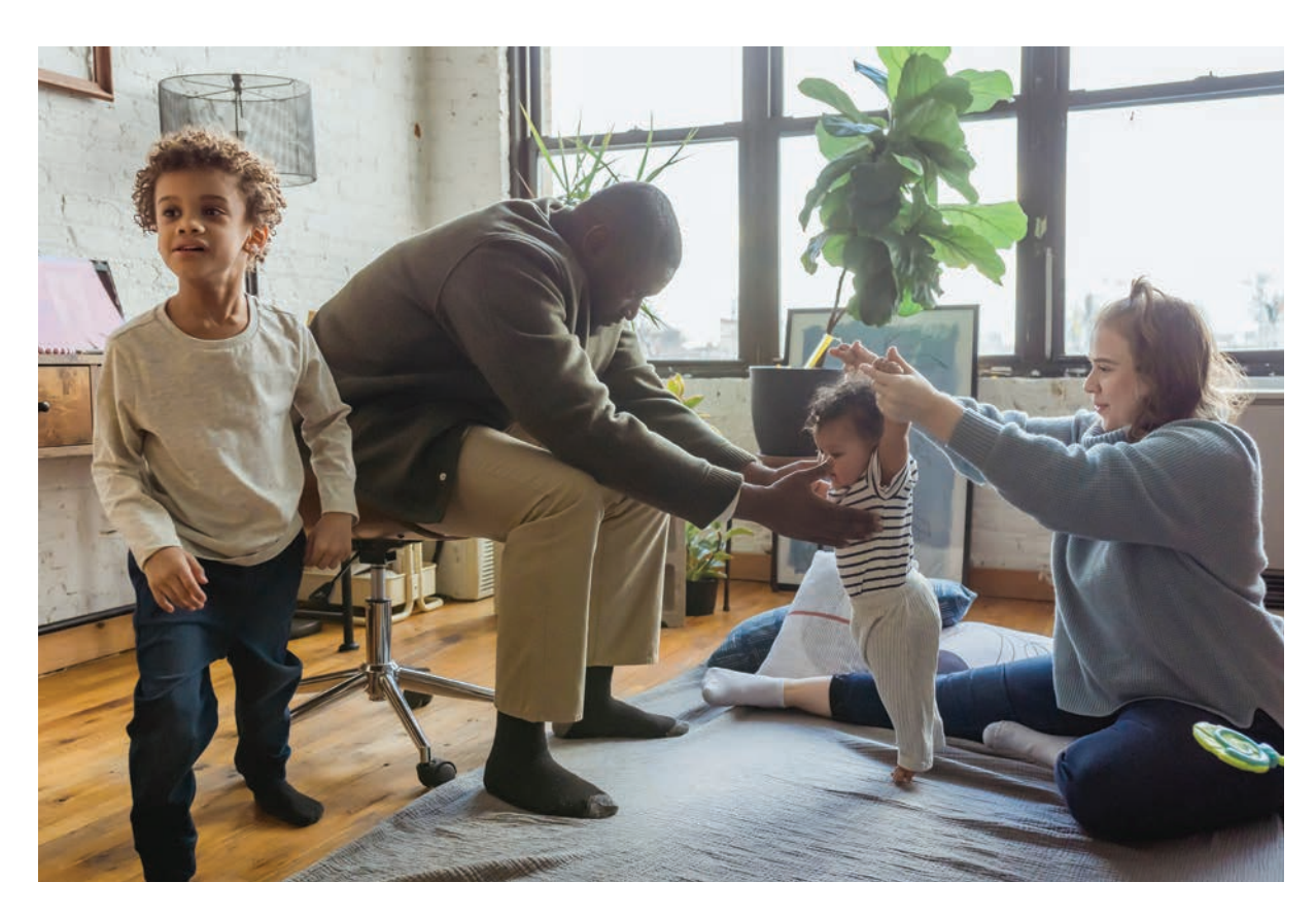
2. Machin, A. (2018). The Life of Dad: The Making of A Modern Father. London: Simon & Schuster.

Most of us can probably think of someone whose parents damaged them in some way. Evidence suggests<sup>2</sup> that it's what we do as fathers, rather than who we are, that really counts (see Box 1 and 2 ).